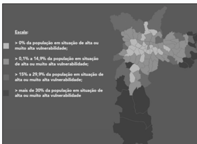
Figure 7 - High and very high Social Vulnerability Index (SVI)