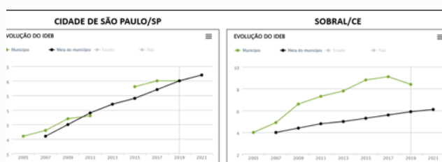
Figure 12 - IDEB evolution: early grades