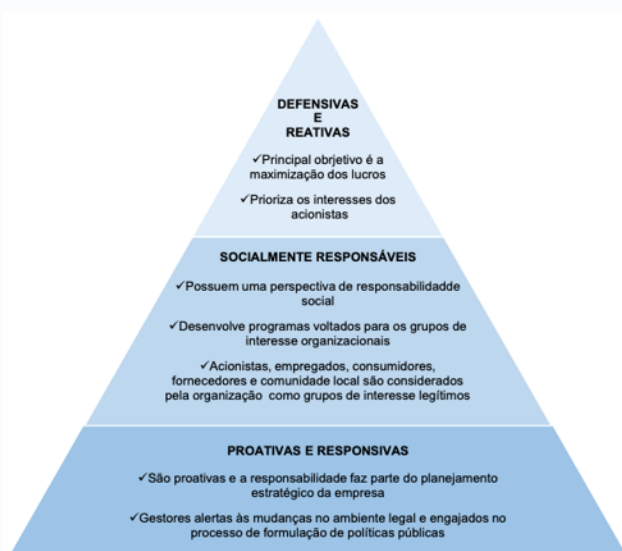
Fig.1, Comparison of behavioral models

(2008) were a prominent proponent of this view. For Friedman, companies should not assume any social responsibility other than seeking profit, respecting the rules of the free market economy. He argued that the only social responsibility of companies was to use their resources to increase profits within the rules of the competitive game, without deception or fraud.