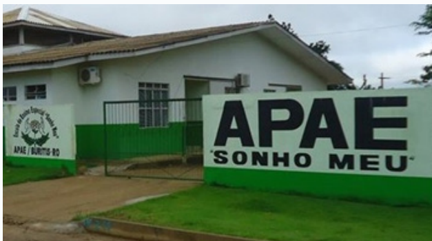
Figure 1: APAE of Buritis